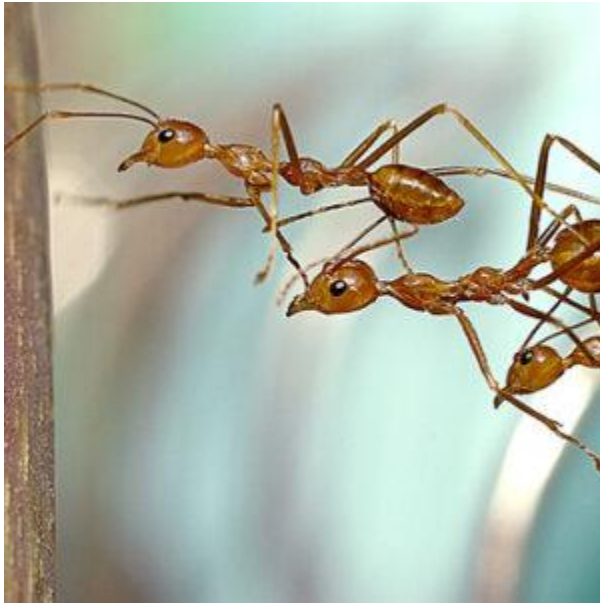
Figure 5: