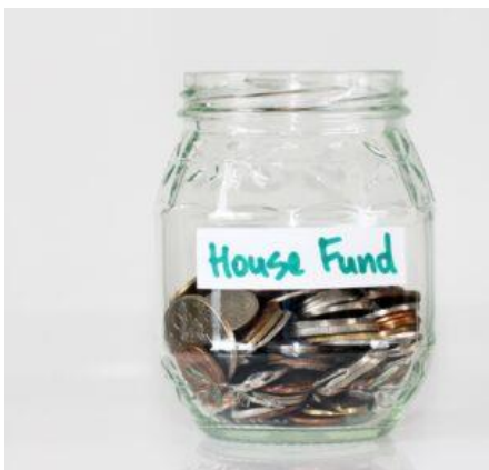
Figure 1: Photo by Sandy Millar on Unsplash

MY FIRST ANSWER TO THE QUESTION "Social service or social change?" is that we need both, of course. We need to provide services for those most in need, for those trying to survive, for those barely making it. We need to work for social change so that we create a society in which our institutions and organizations are equitable and just and all people are safe, adequately fed, adequately housed, well educated, able to work at safe, decent jobs, and able to participate in the decisions that affect their lives.