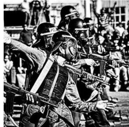
Figure 3: "Riot Control"

During the last half of the 20th century when multiple groups were demanding—and in some cases getting—critical changes in our social structure such as better access to jobs, education, and health care, the ruling classes needed a new strategy to avoid an all out civil war. x