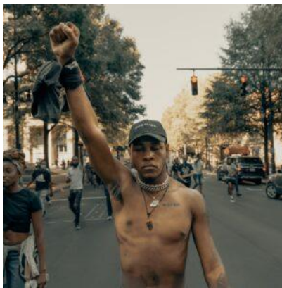
Figure 8: Photo by Clay Banks on Unsplash

Do you connect the participants in your programs/ services/ trainings to opportunities for on-going political involvement? Do you work with participants on issues they define, or on issues you or funders or other's in the buffer/power zone define? Do you give participants tools and resources for getting involved in the issues they identify as most immediate for them, whether those are public policy issues such as immigration, affirmative action, welfare, or health care, or workplace, neighborhood, and community issues such as jobs, education, violence, and toxic waste? When they leave the room after contact with you can they connect what they just learned to the violence they experience in their lives? Are you responsive to their needs for survival, safety, economic well-being, and political action?