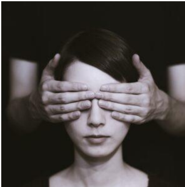
Figure 7:

No one in the United States lives outside the pyramid. We all have jobs that have been set up to funnel benefits up the pyramid and to maintain the status quo. Those of us who are among the bottom 90% and who want to work for social change must do that work subversively. We must make strategic decisions about what the fundamental contradictions are in the system and how we can work together with others to expose those contradictions. We must use our resources, knowledge, and status as social service providers to educate, agitate, and organize for social change. We must refuse to be used as buffer zone agents against our communities. Instead we can come together in unions, coalitions, organizing projects, alliances, networks, support and advocacy groups and a multitude of other forms of action against the status quo.