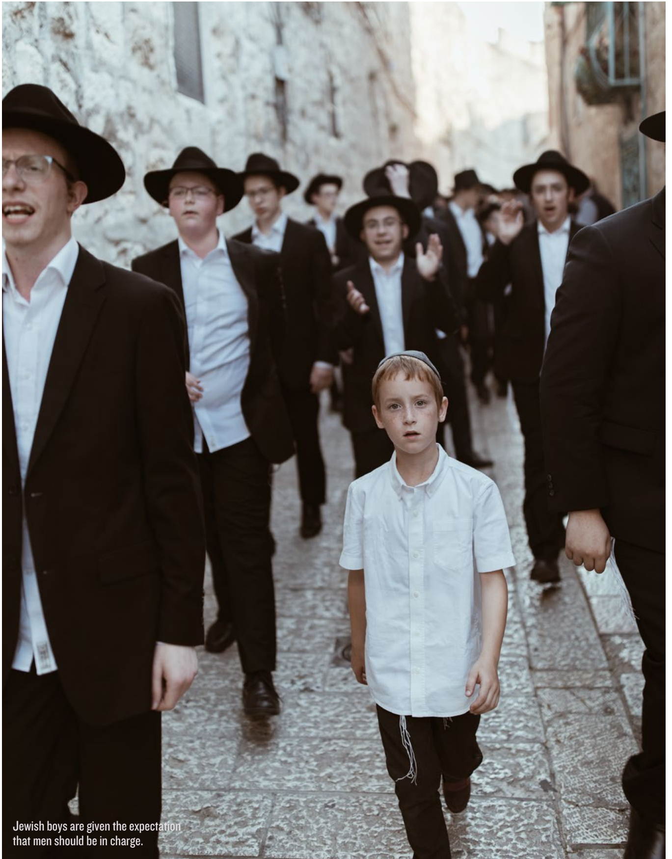
Jewish boys are given the expectation that men should be in charge.